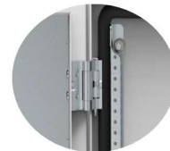
Bracket for cable management