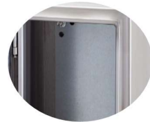
Gutter for better ingress protection