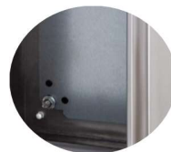
GI Mounting plate