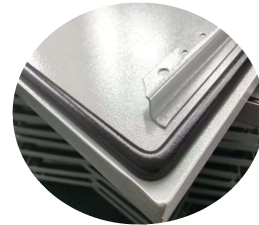
Polyurethane door seal/gasket.