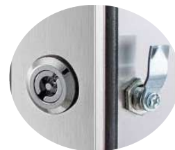
Double bit locks.