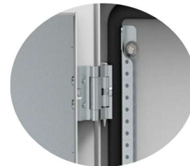
Brackets provided to manage the cables on the door.