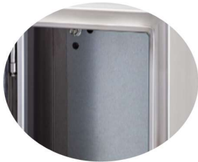
Folded gutter to ensure effective door seal.