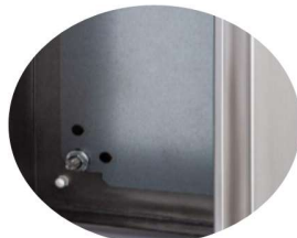
GI mounting plate