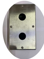
22.5mm holes to fix the P.B.