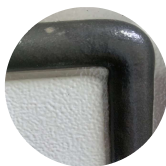
Polyurethane gasket to retain IP66 protection