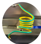
Lid earthed to the box